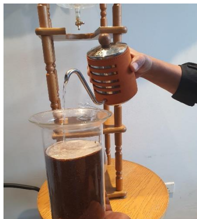
Wet The Filter With Water