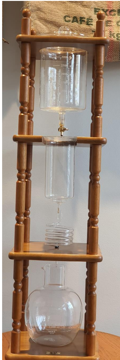
Cold Brew Tower