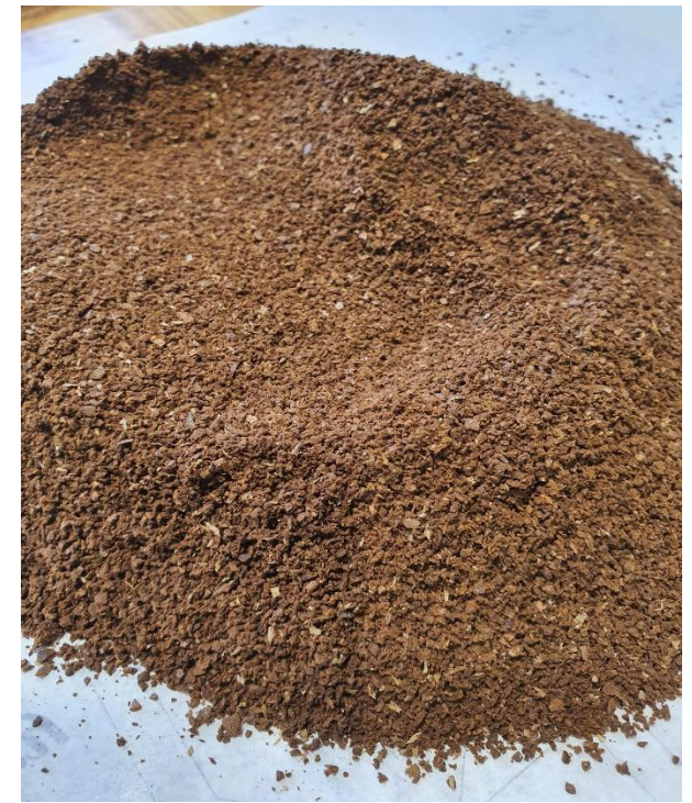
Specialty Coffee grinding